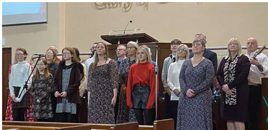
THE CHURCH CHOIR SINGING AT OUR CHRISTMAS CAROL SERVICE ON SUNDAY EVENING 17TH DECEMBER