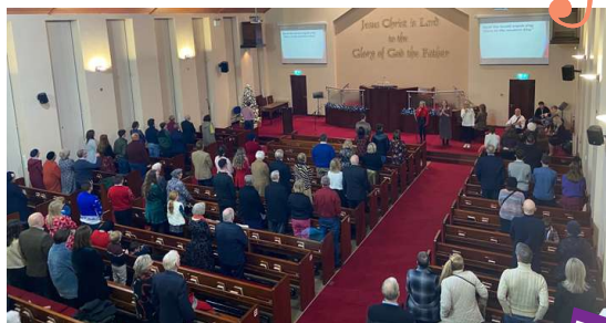
THE CONGREGATION ENJOYED THE CHRISTMAS CAROL SERVICE