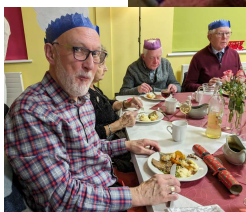
THE SENIORS TUCK IN TO A DELICIOUS CHRISTMAS DINNER