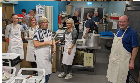
THE CALM BEFORE THE STORM IN THE KITCHEN!