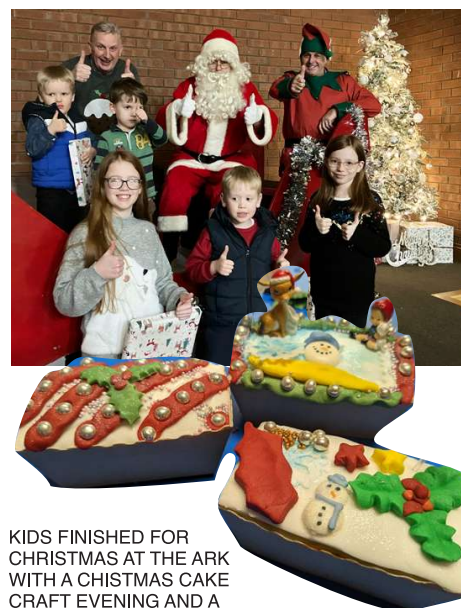
KIDS FINISHED FOR CHRISTMAS AT THE ARK WITH A CHRISTMAS CAKE CRAFT EVENING AND A VISIT FROM SANTA!